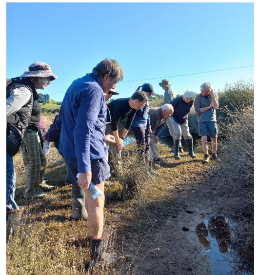
Survey volunteers being inducted on what banded rail prints and poo look like

Many thanks to Graeme Elliot of DOC for educating us and supporting the project.